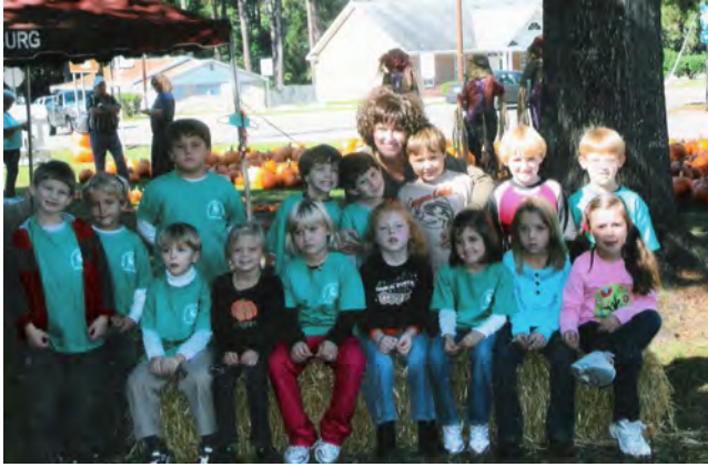
5K students enjoyed a visit the Kingstree Community Youth Pumpkin Patch.