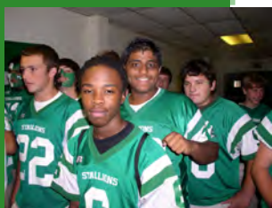
The Stallions prepare for the pep rally.

WA students enjoyed the first pep rally of the 2010-2011 school year on Friday, Aug. 20. The cheerleaders put together a great show that kept the students on their feet and the varsity football team busy! The Stallions have a 2-0 record with a game coming up in Savannah on September 3. Check out the WA website for game schedules for all WA sports.