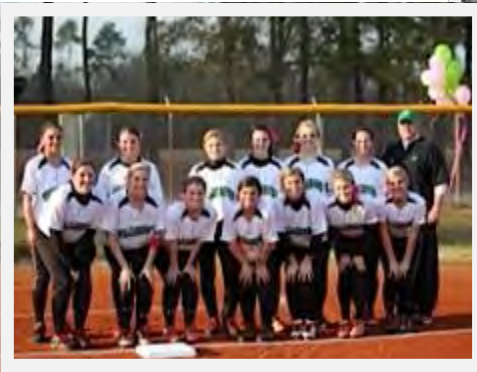
The team poses at third base.