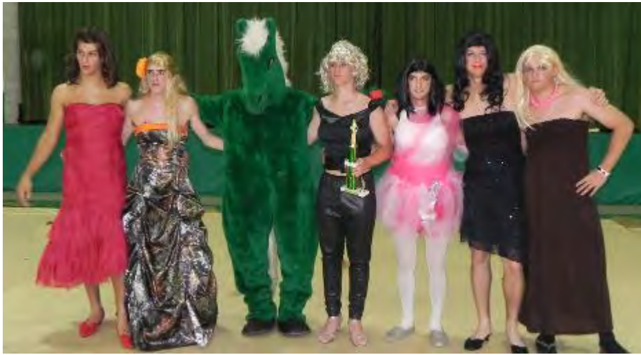
Mr. Homecoming Contestants