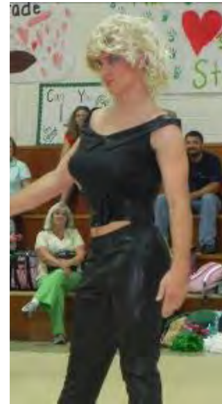
Mr. Homecoming 2012